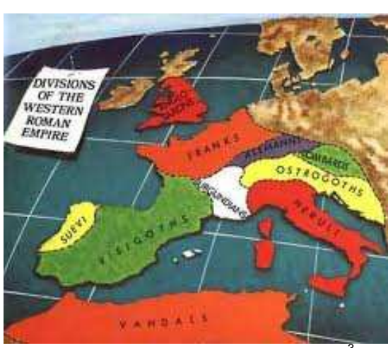
igure 1: Ten Kingdoms of the Western Roman Empire<sup>3</sup>

Western Europe was the territory peculiar to Rome. The other territories which she conquered were territories peculiar to Greece, Persia and Babylon, etc. The ten divisions or kingdoms were formed from the Western division of the Roman Empire.