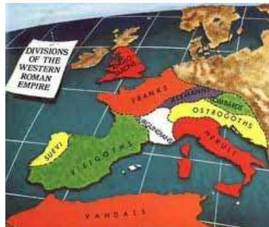
Figure 1: Ten Kingdoms of the Western Roman Empire 3

Western Europe was the territory peculiar to Rome. The other territories which she conquered were territories peculiar to Greece, Persia and Babylon, etc. The ten divisions or kingdoms were formed from the Western division of the Roman Empire.