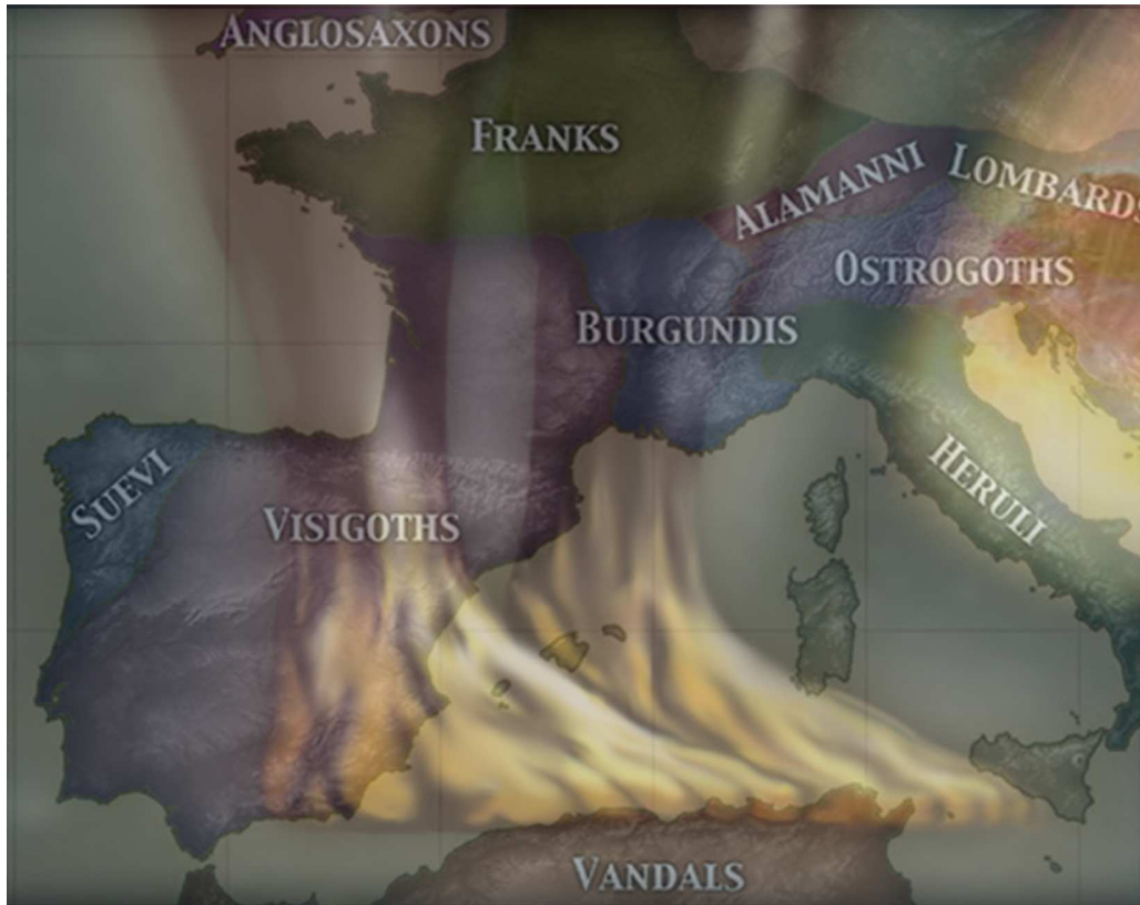
Figure 1: Ten divisions of Western Europe 6

What then do the ten horns represent? According to Daniel 7 they represent the ten kingdoms of Western Europe into which Western Rome was ultimately divided (Daniel 7:7, 24). The ten horns are mentioned ten times in the books of Daniel and Revelation and they always represent, initially, the ten divisions of Western Europe. Therefore Western Europe must form a part of the dragon's power.