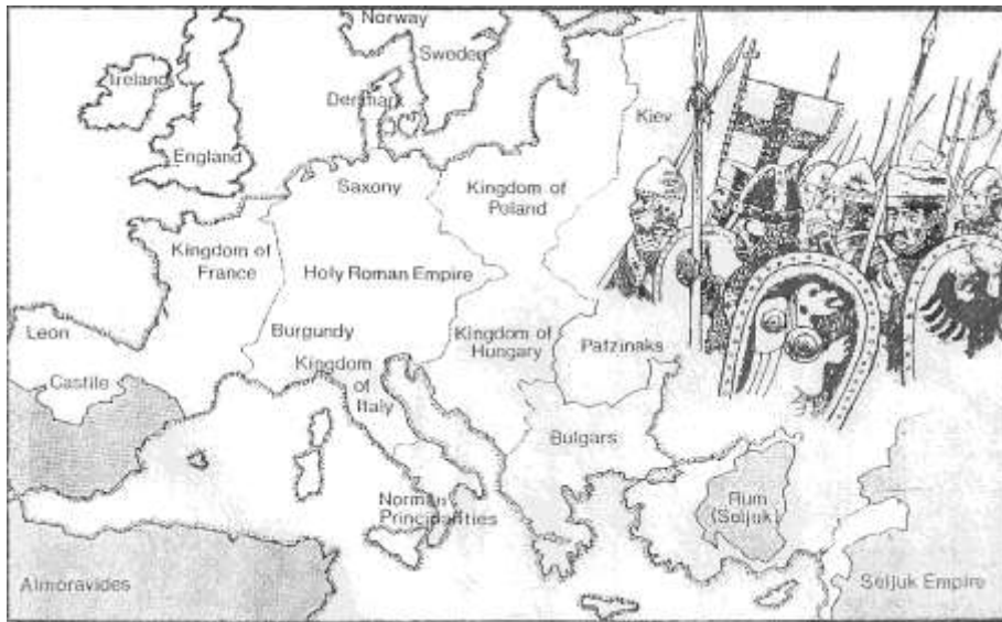
Figure 2: The Crusades against the Seljukian Turks

The Seljuks then conquered Arabia, Yemen, Egypt and West Africa, and further extended their empire eastward to the Indus River - the border of India. Northwards they conquered territory clear across to Kashgar on the Chinese border. It was while they controlled the Middle East that appeals were made to Europe to deliver Palestine from the Turks. This resulted in the establishment of the Crusades.