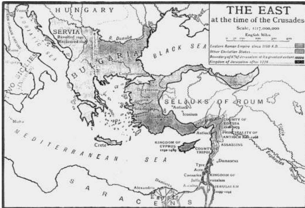
Figure 3: The East at the time of the Crusades.

The crusaders drove the Turks out of much of Asia Minor, forcing them to remove their capital from Nice to Iconium. Later the Seljuk power was well nigh destroyed by the Tartars, under Tamerlane, when they overran the Middle East. The Mogul's empire reached from the Sea of Japan in North China right across to the Caspian Sea. In Moscow today you can see memorials of mighty battles that were fought by the Russians against the Tartars.