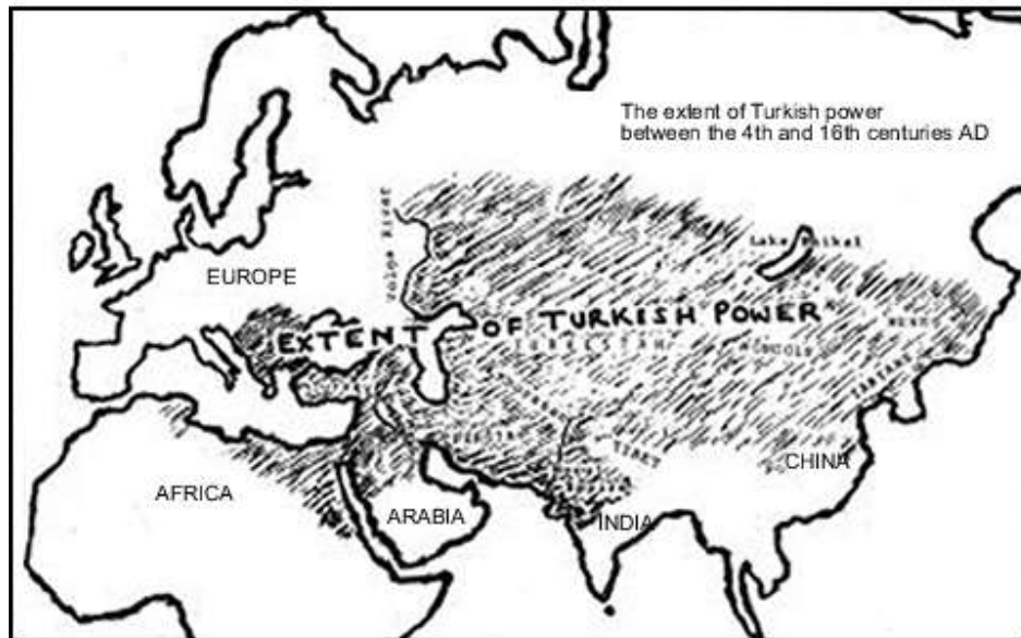
Figure 1 – the extent of Turkish power at various intervals between the fourth and sixteenth centuries AD.

In 800 AD Turkish soldiers were employed as mercenaries by the Arabian caliphs in Baghdad. As a consequence, before very long, Turkish officers had taken control of the territories where the Caliph reigned, which is how the Turks first emerged in the Middle East. 9