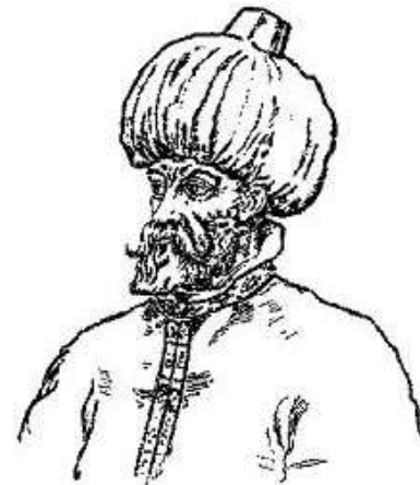
Muhammed II (1430-1481)

....the door would open to them, by its capture, to conquer the whole of the Greek empire (Eastern Rome) 32